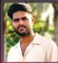
ABU SINAN A