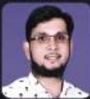
SREEJITH T KSE MIL controls Ltd