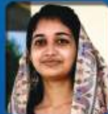
NIFIHA K N