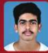
FAWAS Chief Accountant Hilinaal Finishing School