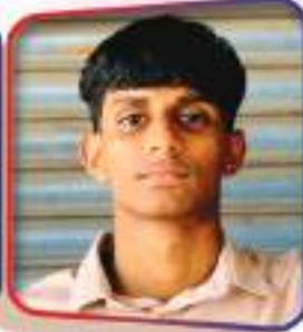
AL AMEEN N V