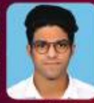
ANFAS Finance Support VKC Group